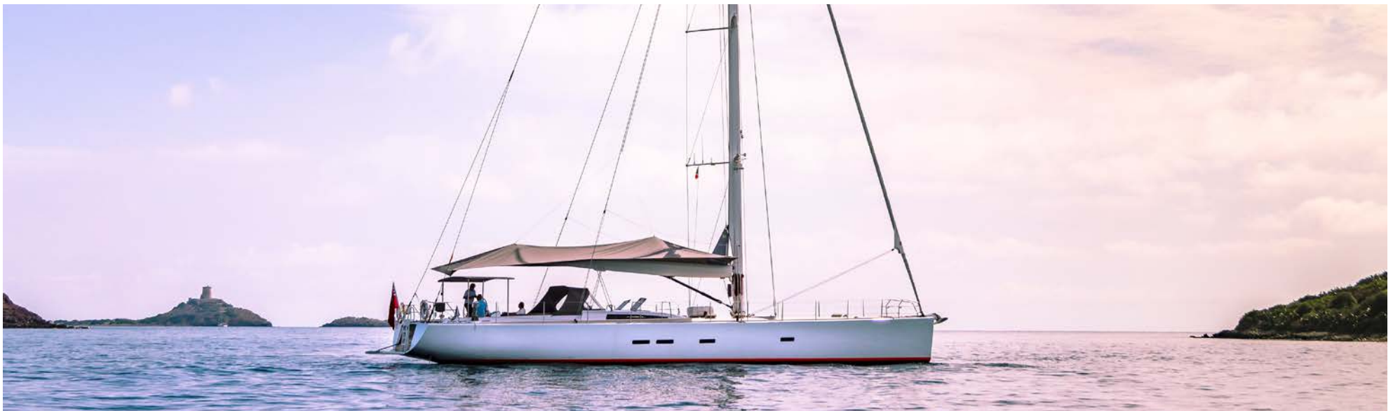
82ft JFA "IKIGAI"