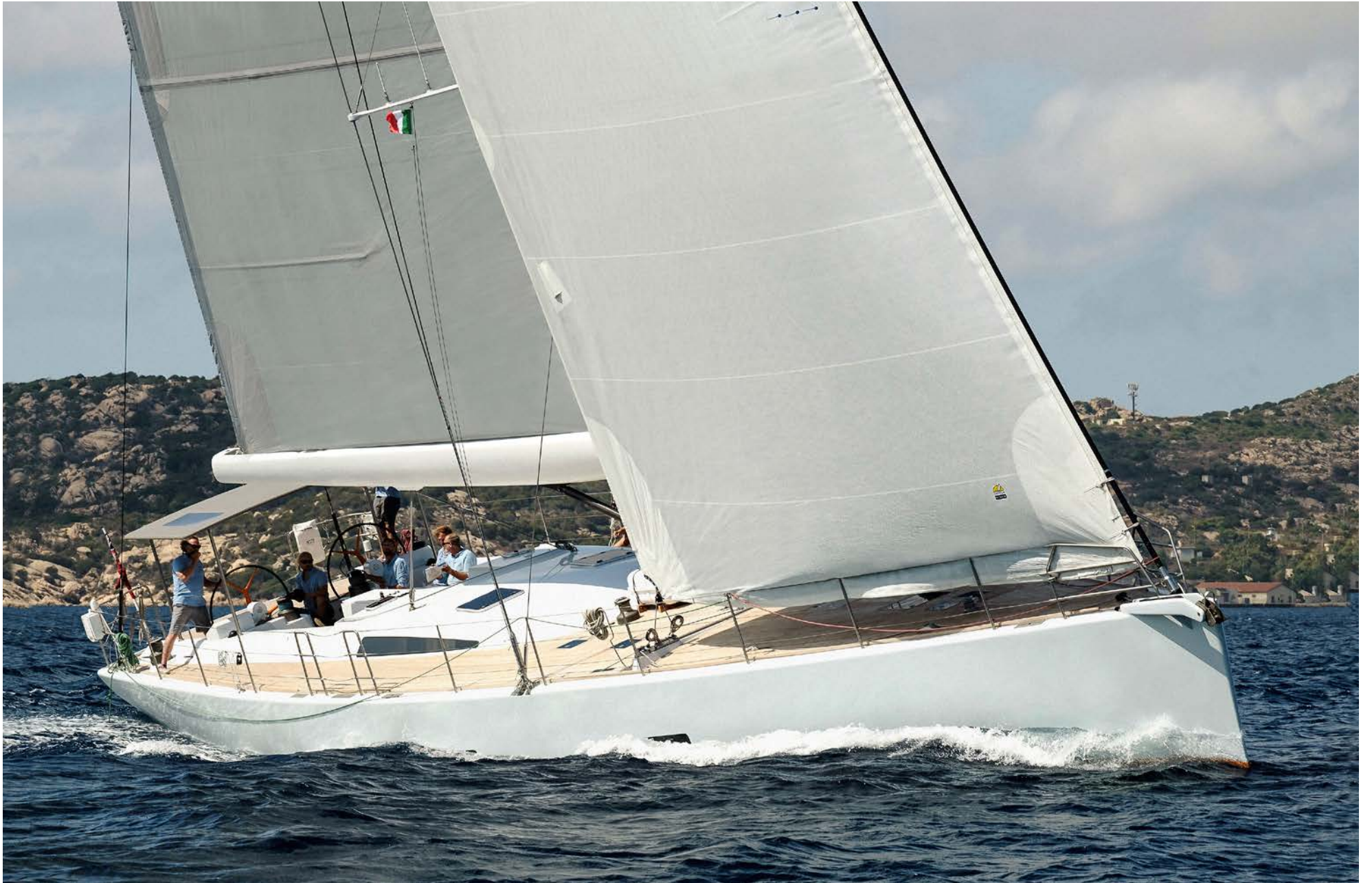
82ft JFA "IKIGAI"