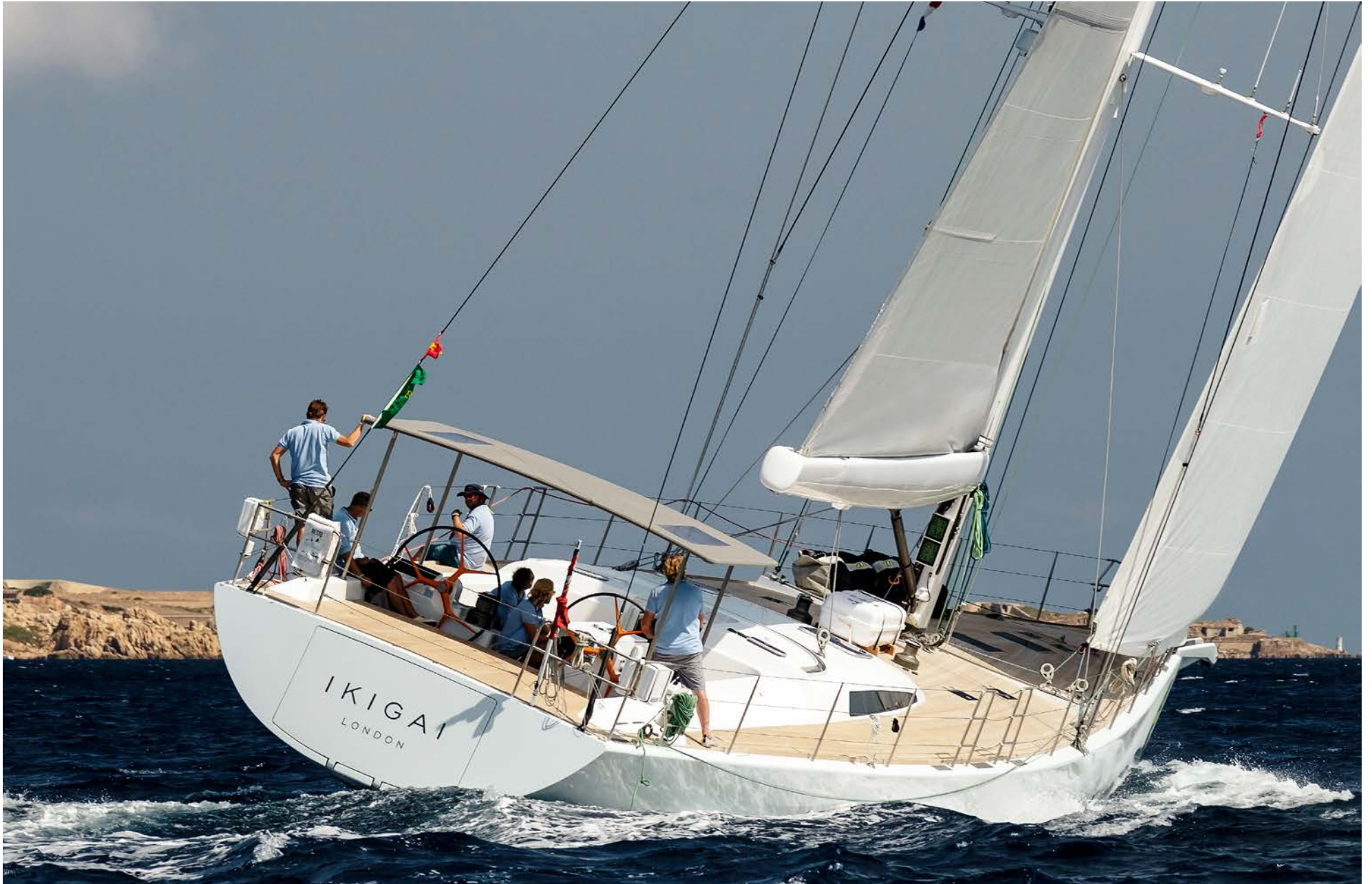
82ft JFA "IKIGAI"