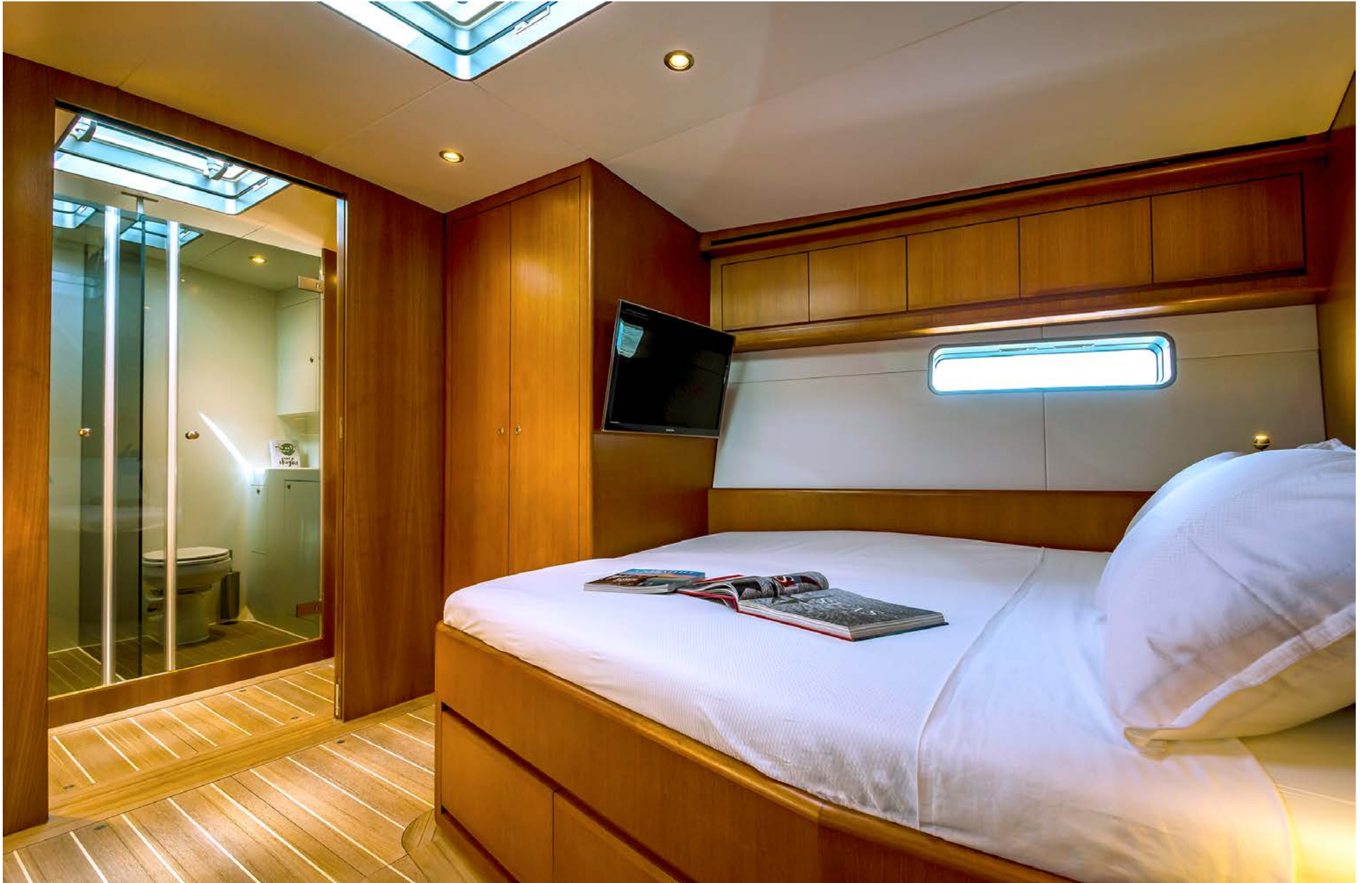
82ft JFA "IKIGAI"