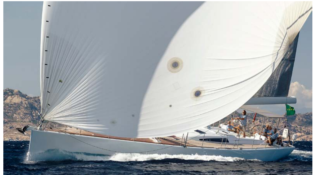
82ft JFA "IKIGAI"