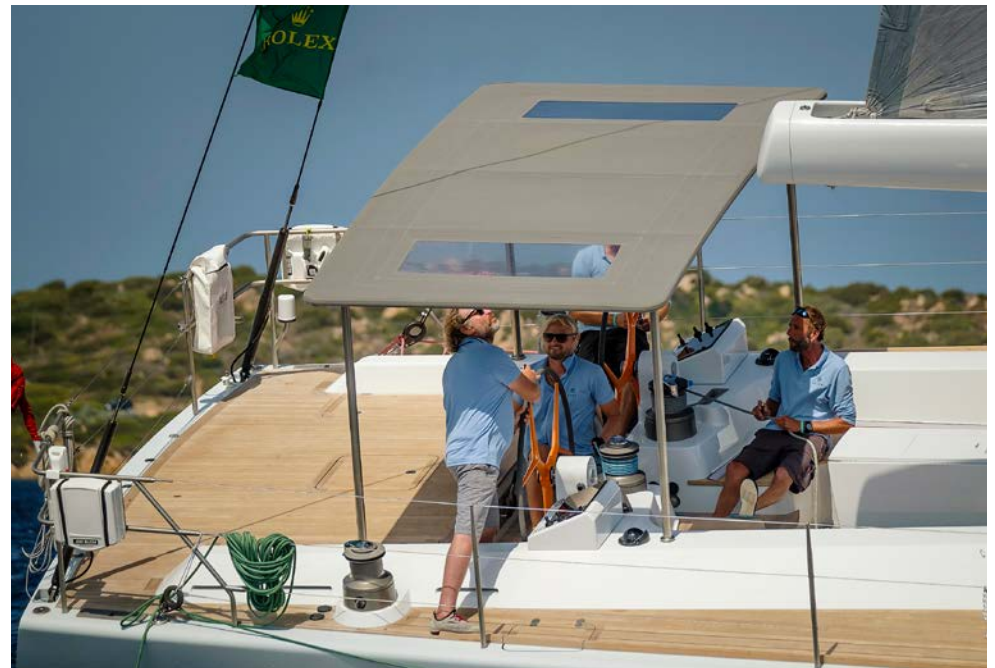
82ft JFA "IKIGAI"