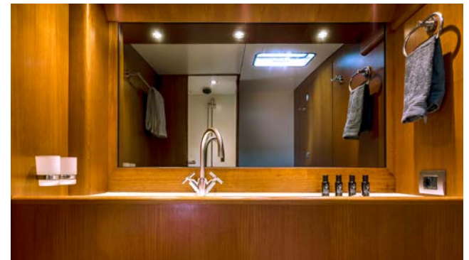
82ft JFA "IKIGAI"