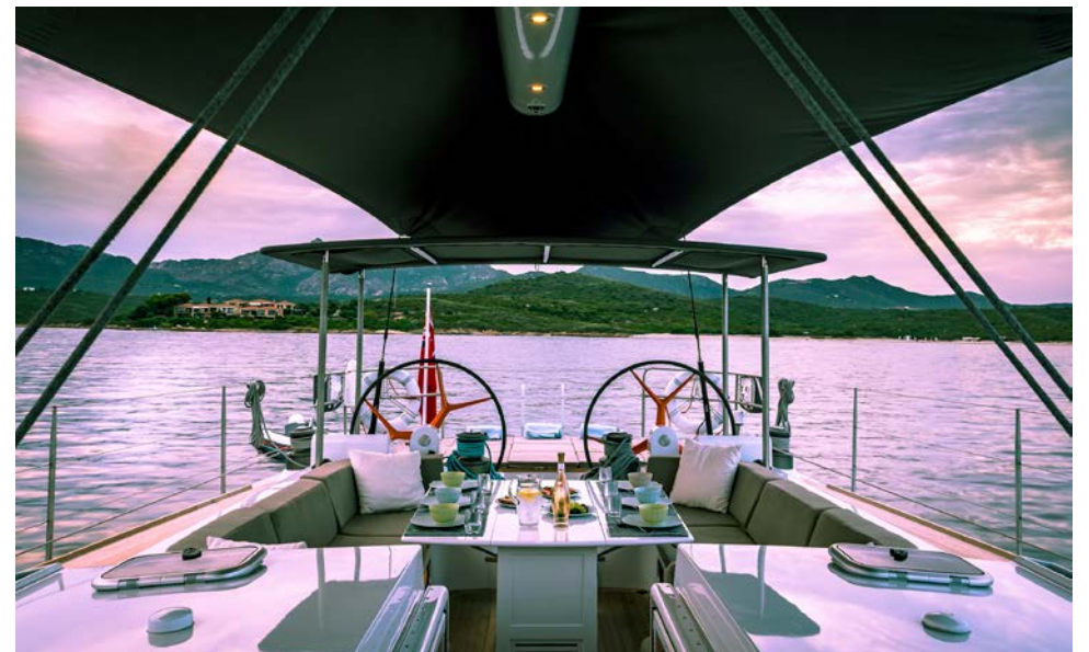
82ft JFA "IKIGAI"