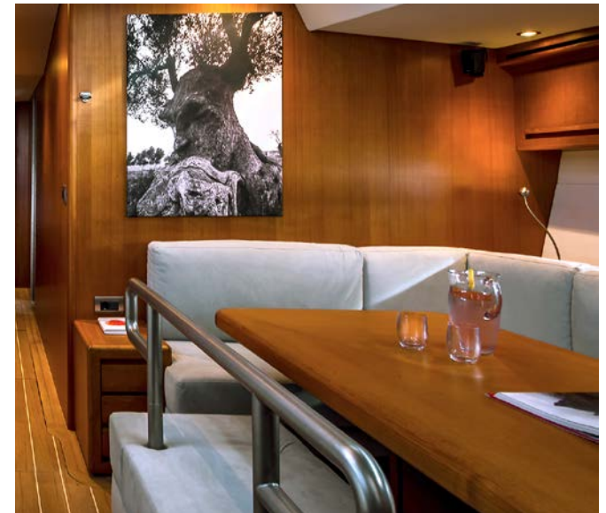
82ft JFA "IKIGAI"