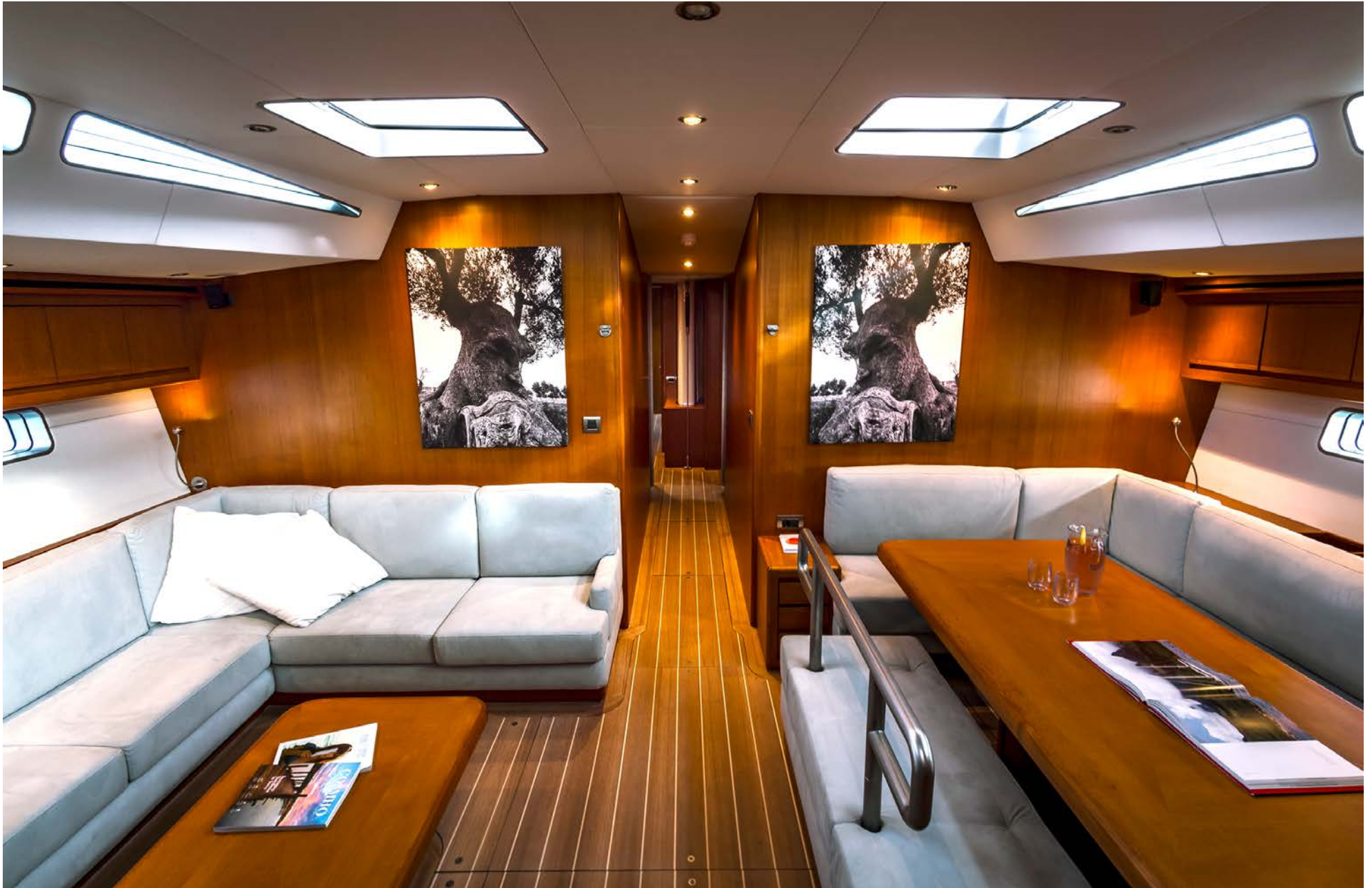
82ft JFA "IKIGAI"