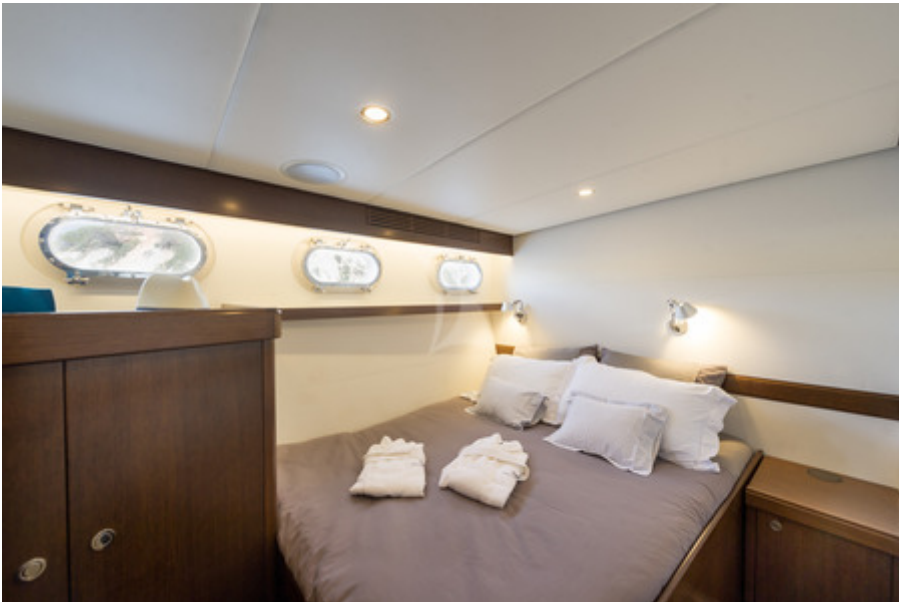
Convertible Double/Twin bedroom