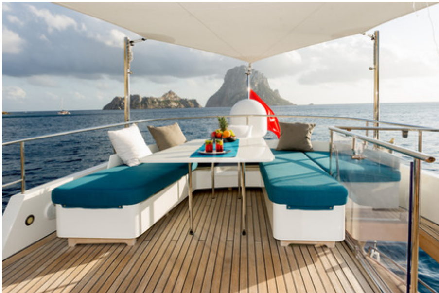
Convertible sunbed area