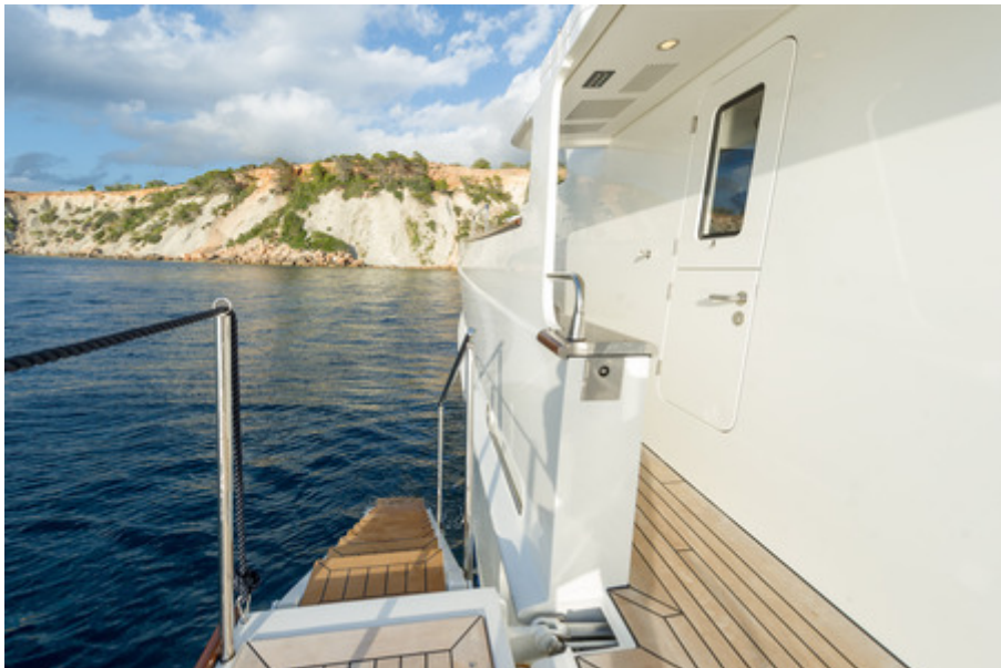
Bathing ladder portside providing easy access to the water