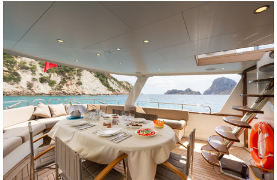
Al fresco dining