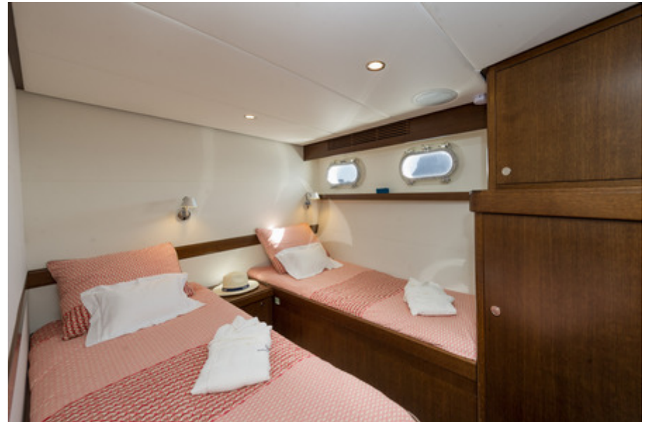
Convertible Double/Twin bedroom