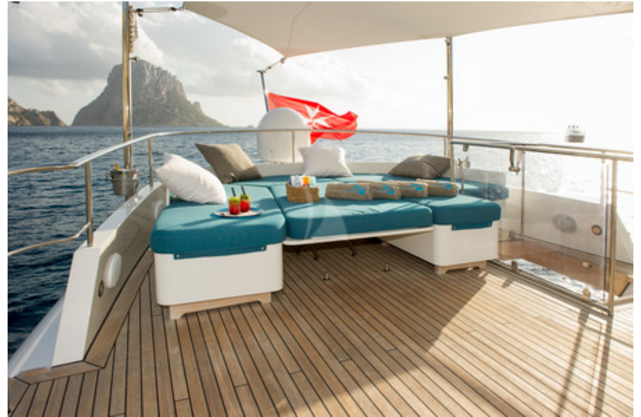
Convertible sunbed area