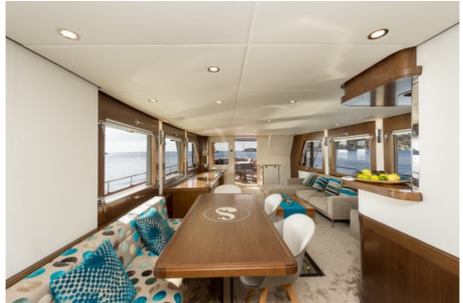
Formal dining table