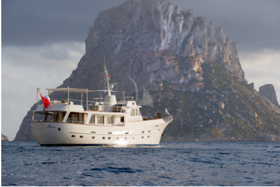
Side Cruising Shot