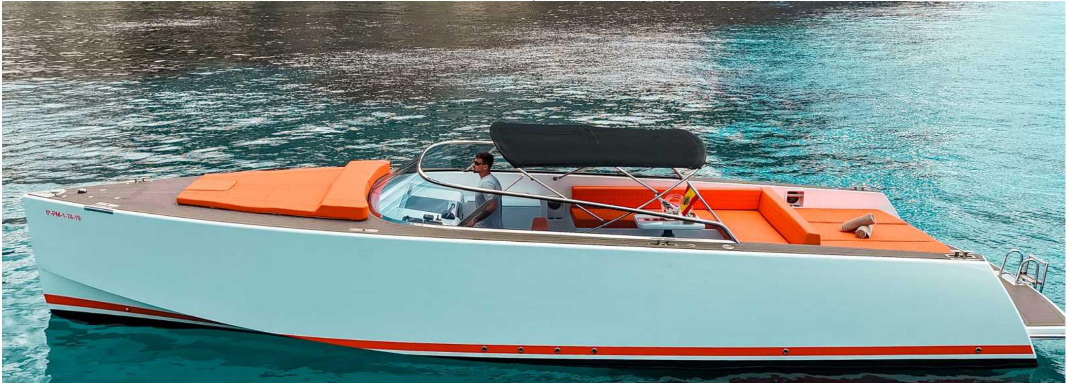
VAN DUTCH 40

The iconic VanDutch 40 design is the ultimate symbol of sophistication in Ibiza. Represented by Jet Service Yacht Agency , these vessels offer a vanguard, open-plan space for up to nine guests, where the deck becomes the perfect stage to see and be seen. Whether cruising with the power of Yanmar engines or anchored in an exclusive cove, the experience is one of pure comfort: an endless sun deck, a cozy cabin, and the freedom to enjoy with your pets and loved ones in a completely private setting. A blend of speed and minimalist luxury for those who demand nothing less than excellence.